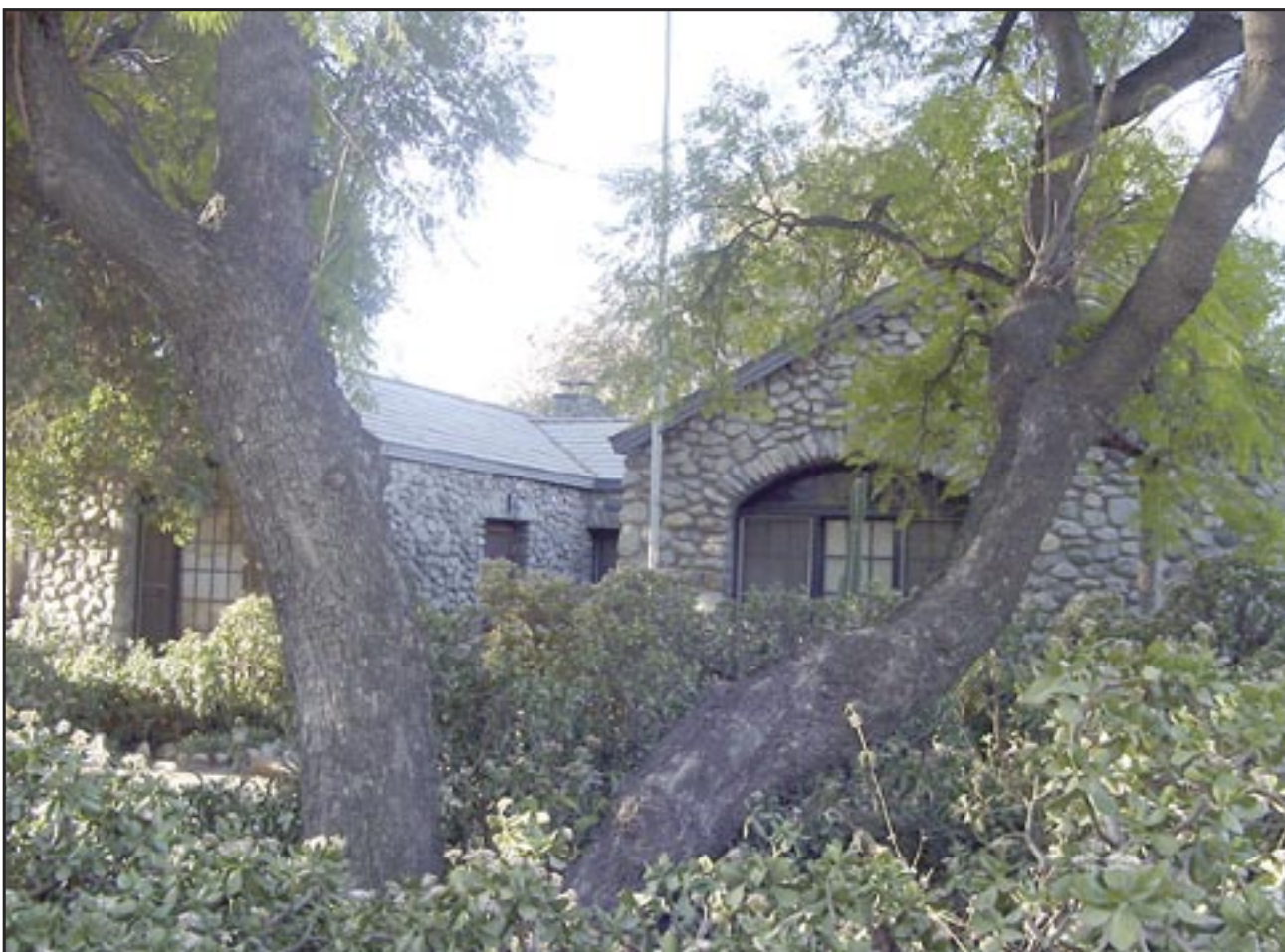
One of 66 structures made of stone still exist in the Stonehurst tract built around 1926.