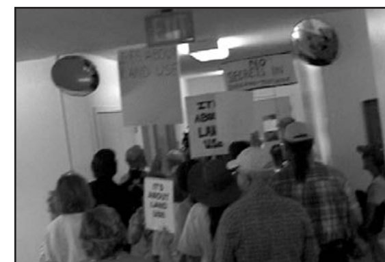
residents try to enter the meeting room only to have door closed in their face and windows covered