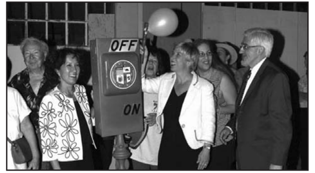
Councilwoman Wendy Greuel "flips the switch"

COBRA is planning future events and improvements on Commerce. Their current project is to raise $15,000 for the installation of an antique clock on the southwest corner of Commerce and Tujunga Canyon Blvd. Councilmember Greuel helped kick off the project with a donation of $500 towards its purchase.