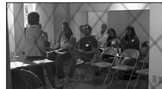
some of the secret participants/community leaders