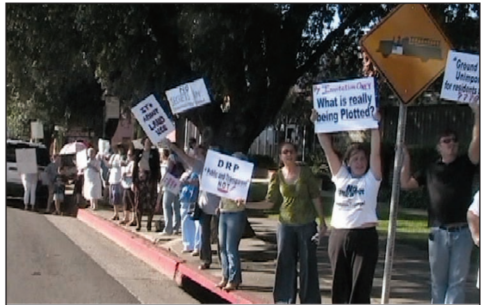
Sunland-Tujunga neighbors upset that door is closed to City building