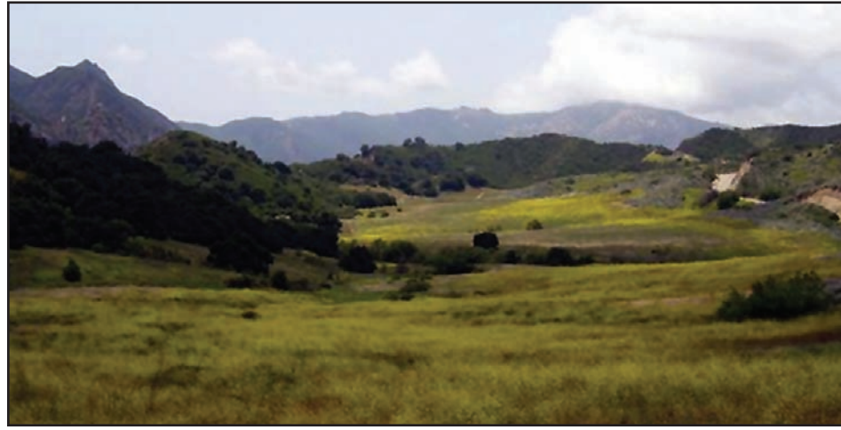
Reagan Ranch in bloom in the spring.