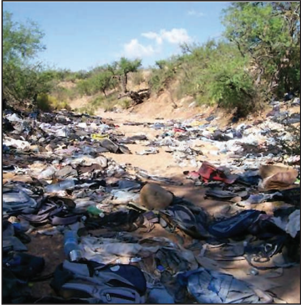
'Illegal super - highway' from Mexico to the USA (Tucson) used by human smugglers.