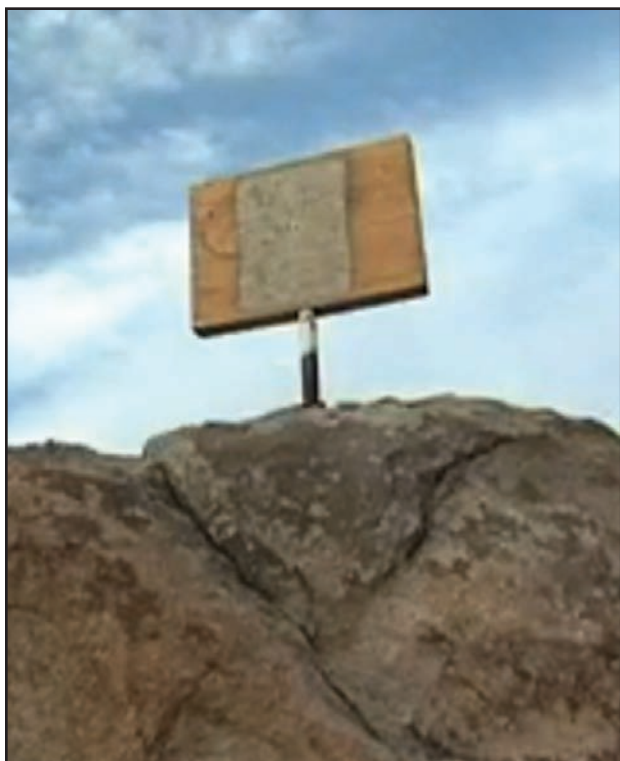
Cross was covered until Court Decision allowing it to stay

Just two weeks after the U.S. Supreme Court ruled to protect the Mojave Desert War Memorial, thieves wantonly stole the cross from its perch atop Sunrise Rock in the Mojave Desert Preserve. The cross has stood there for 75 years. On May 10th, a Park employee noticed the cross was missing and noted that it had been removed sometime through the night.