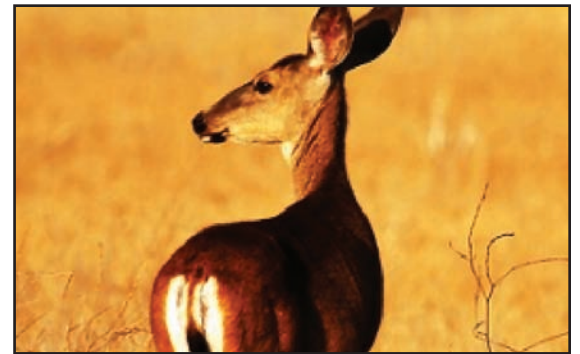
Preservationists believe choosing the historic Reagan Meadow for the site of the new Ronald Reagan Equestrian Campground and RV Park threatens open space and wildlife and the new facility will mar the view for miles.