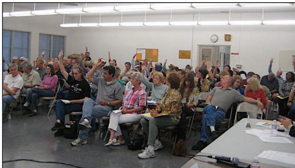
Dept. of Sanitation asked for a "show of hands" by Septic Tank Owners during a recent meeting.

If an OWTS fails inspection, (for which specified definitions and terms are not defined), owners within 200 feet of a sewer line will be forced to hook up to the city system. This will entail another range of fees and expenses for property owners, a situation the B of S staff was not aware of at the time of their recent presentation meeting in the La Tuna Canyon community. This was later admitted by them during the Sunland-Tujunga Neighborhood Council's Land Use Committee Meeting in May. B of S estimated that a new septic system would cost $30,000 with only a $758 hook up fee to a sewer line. But it was apparent they didn't check with Building and Safety, Public Works, or local contractors. Local residents quickly pointed out that costs by other L.A. City departments include $13,000 per 50 to 100 feet additional sewer line extension hook up to the edge of the property line, plus building permit fees ranging from $6,000-$15,000, repairs to street, an additional