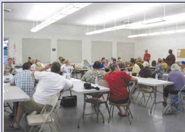
Approximately 50 people attend the Bureau of Sanitation for a hearing in the North Valley held in Sunland-Tujunga regarding Septic Tank requirements.