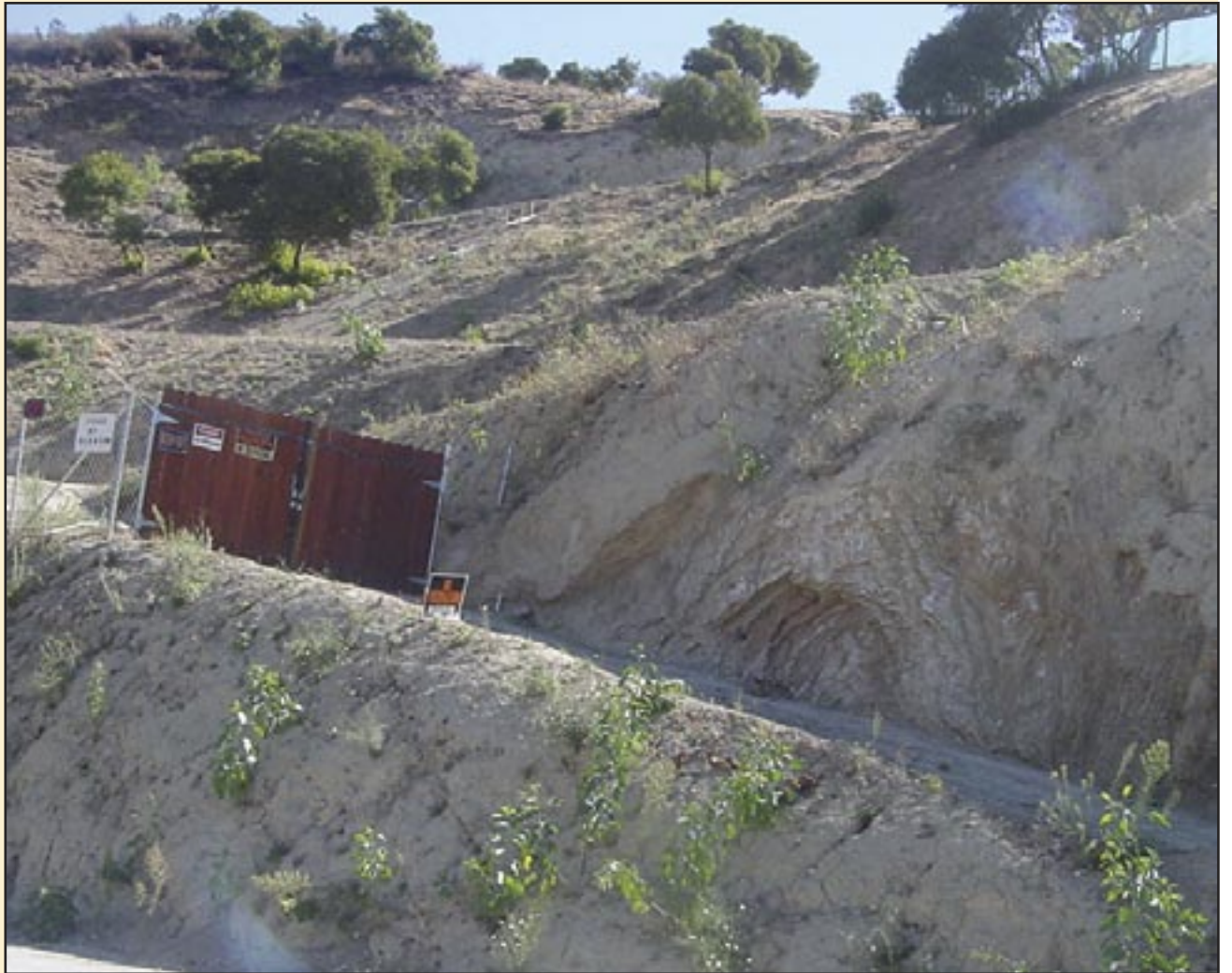
Neighbor say that the driveway has been graded into the hillside without permit or soil samples