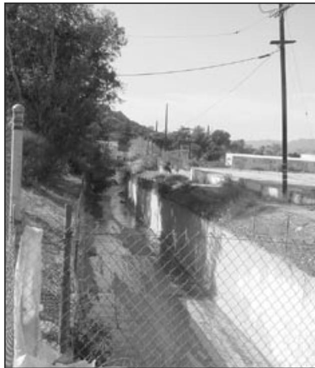
Hains Channel at Commerce and St. Estaban, is a proposed project site to create biking and walking access along the channel.

These were some of the questions explored as The Tujunga Watershed Project held a Workshop Oct. 9 at Bolton Hall. The workshop, facilitated by Zack Freedman and Melanie Winter from The River Project, included several community stakeholders and Sunland-Tujunga neighbors, including members of Sunland-Tujunga Neighbor-