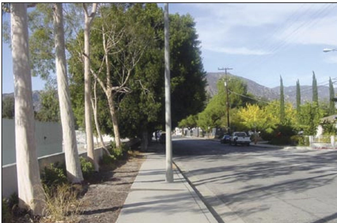
Residents of Woodard Street do not look forward to Home Depot as neighbors