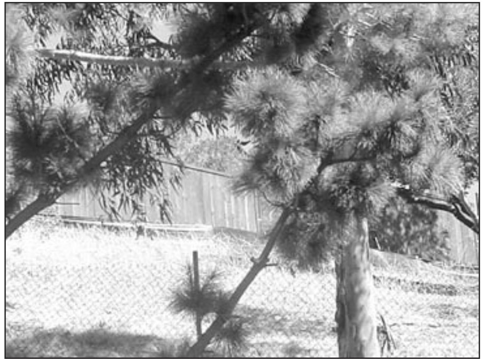
Residents hear pebbles bouncing down the hill at night

on the homes and continue to build. He will sell them and they will be left with the aftermath when he is no longer accountable.