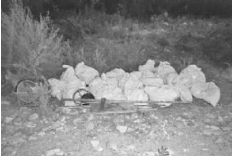
Twenty-one bags, count them

Major clean ups were not done by County Flood Control. If it had been so, then how is it that I was able to pick up trash for 8 to 12 hrs every day for 7 days in a row? And came up with 35 (45 gal size) trashbags full of trash? And how is it that after the 2nd major clean up (3 weeks later) on Coastal Clean up Day September 16, 2006 we picked up approximately one ton more of trash (see pg13 in the Sept.27th issue). The statement "It took many men filling dump trucks full of ....." is false! Yes, it did take many men and many